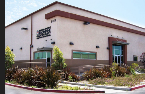
Outside of the food bank