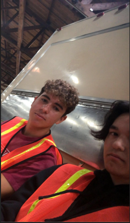
My friend and I at the food bank