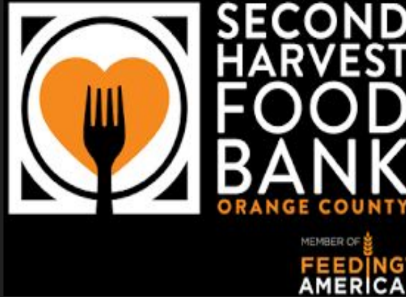
The food bank's logo