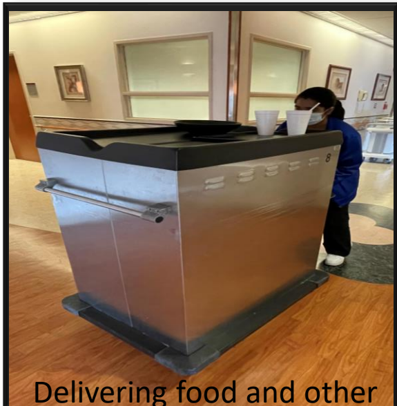
Delivering food and other necessities for patients.

This demonstrates the teaching of the Life and Dignity of another person because I am helping and caring for the sick and taking care of their needs, while keeping their emotions and opinions in mind.